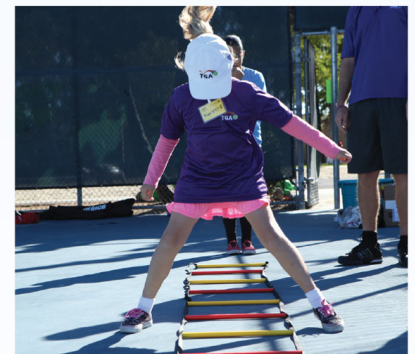
Exercise & Stretching