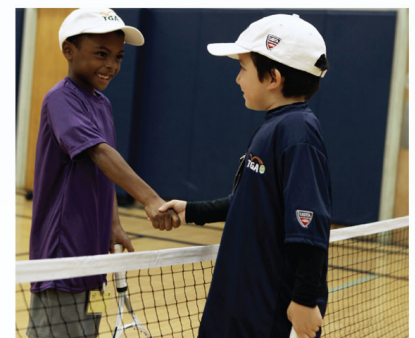
Character Development Theme