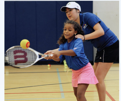
Group and 1 on 1 Tennis Instruction