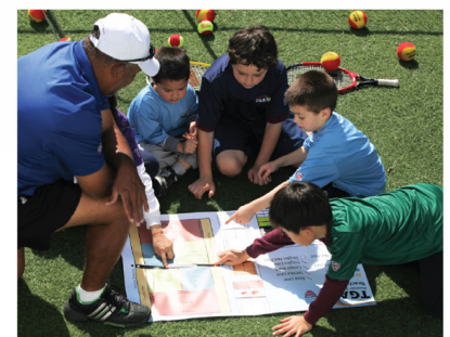
Etiquette & Academic Lessons